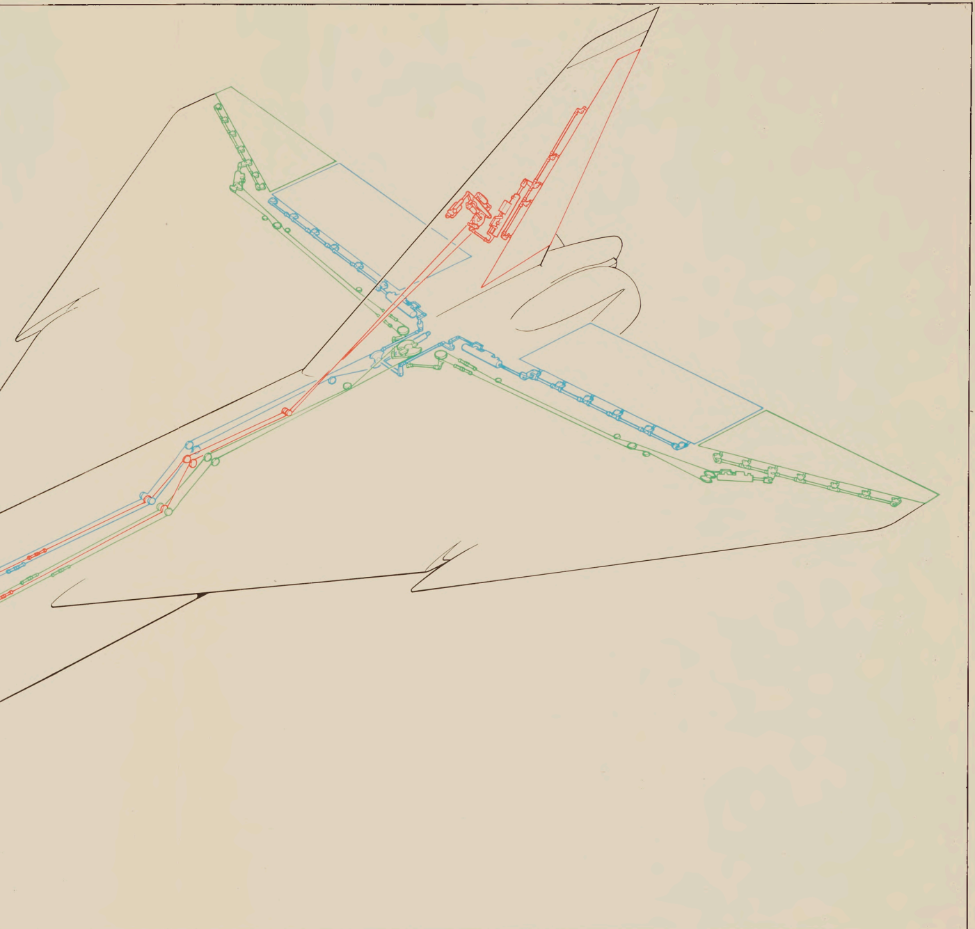
FIG. 1 FLYING CONTROLS - SCHEMATIC